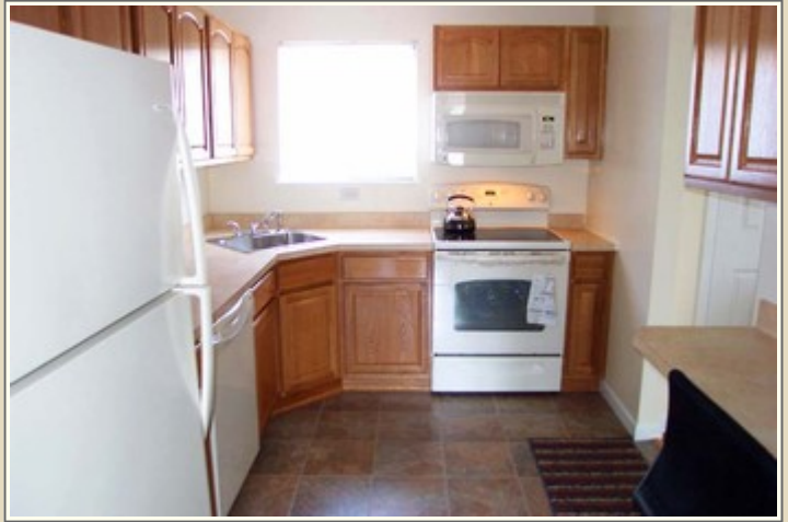
New Oak Cabinets